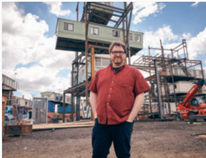
Cline on set.

Growing up in Ohio has had a profound effect on my writing, since that was where I experienced the pop culture of the 70s and 80s, as well as the rise of video games and home computers—all things I draw upon in my work.