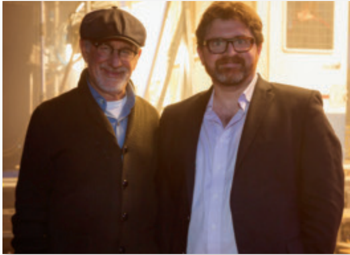
Steven Spielberg and Ernest Cline on set.

Q Readers of Ready Player One are really excited to return to that world—what are you most excited for them to see in Ready Player Two ?