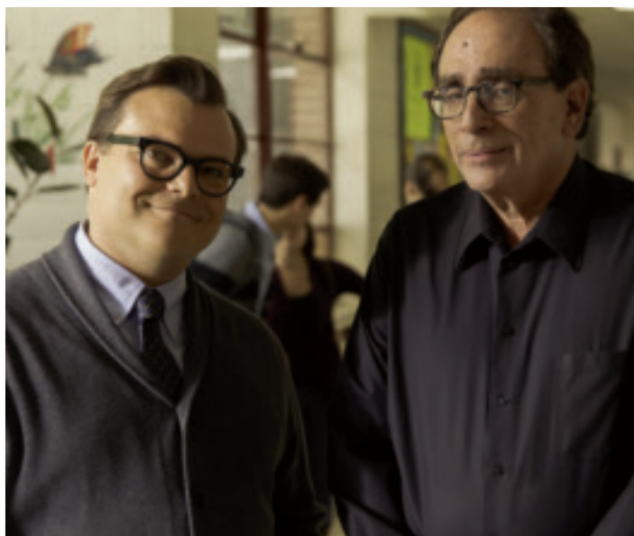
Jack Black (left) stars in Goosebumps as a fictionalized version of author R. L. Stine (right).

In the mid-2010s, it was announced that Captain Underpants would be adapted into a CGI feature film by DreamWorks animation. The movie was released in 2017, followed by a sequel TV series on Netflix, The Epic Tales of Captain Underpants , in 2018. The character of Captain Underpants is voiced by Ed Helms, while Kevin Hart and Thomas Middleditch provide the voices for