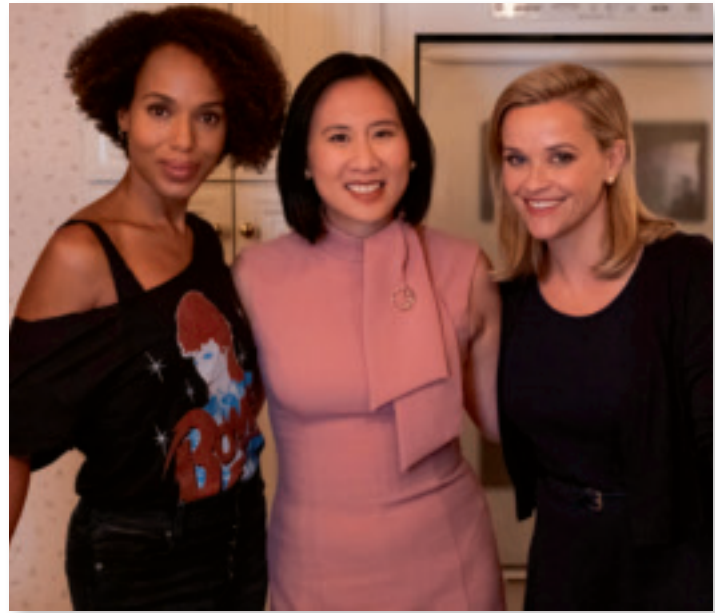
From left to right: Kerry Washington, Celeste Ng and Reese Witherspoon on the set of Little Fires Everywhere.