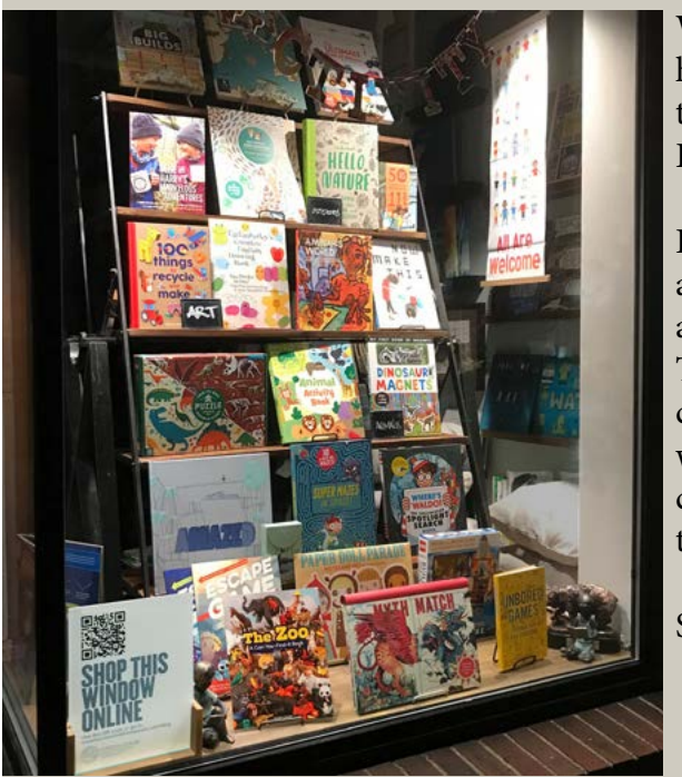
The "Shop This Window Online" display at Cover to Cover Books for Young Readers in Upper Arlington was recently highlighted in Publishers Weekly magazine.

We'd like to salute businesses that have been particularly hard hit in this crisis: bookstores. Not only was April 25 set to be the Ohioana Book Festival, it was also National Independent Bookstore Day. Of course, that had to be cancelled, too.