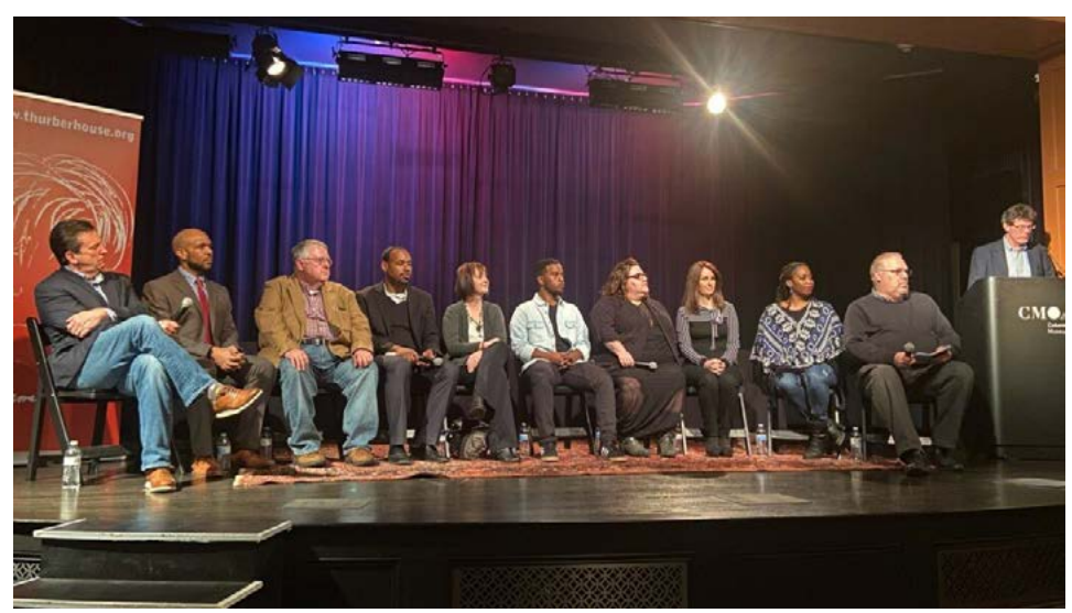
Columbus Noir authors appear at the Columbus Museum of Art on March 3.

For more information on Columbus Noir , visit www.akashicbooks.com/catalog/columbus-noir/.