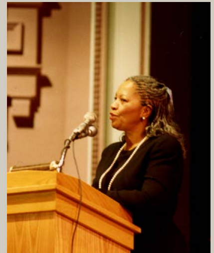
Toni Morrison accepts the Ohioana Career Medal in 1988