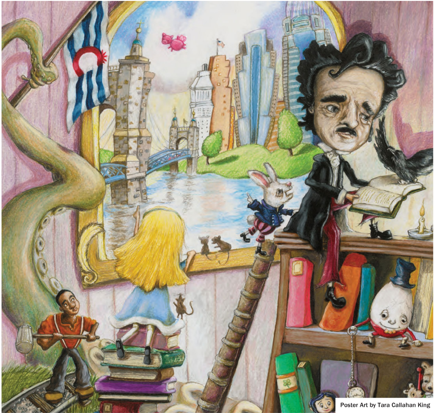
Poster Art by Tara Callahan King