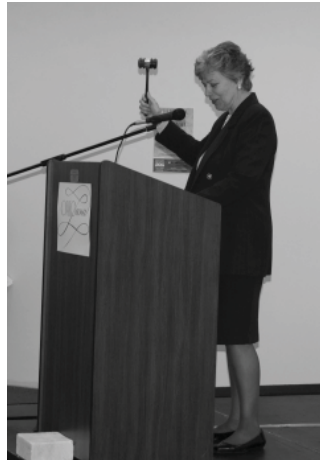
Ohio's First Lady Frances Strickland opens the 2010 Ohioana Book Festival.