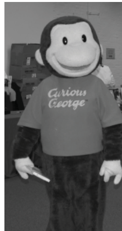
Curious George passes out DVDs to kids.