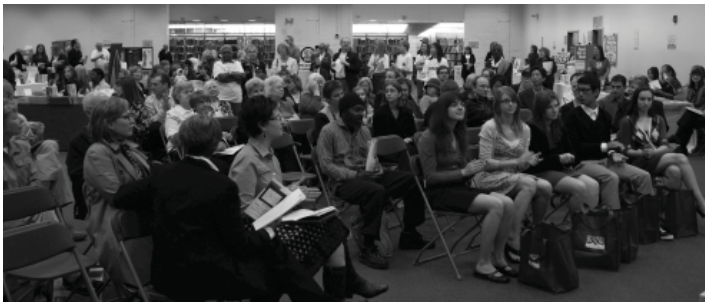
The crowd at the festival opening.